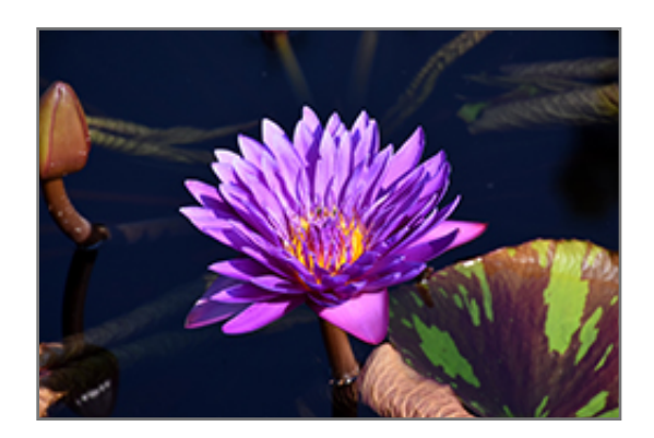
Tanzanite Tropical Water Lily flowers