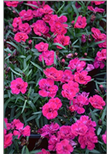
Beauties Tiiu Pinks flowers

Beauties Tiiu Pinks is recommended for the following landscape applications;