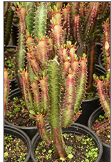
Rubra African Milk Tree in full