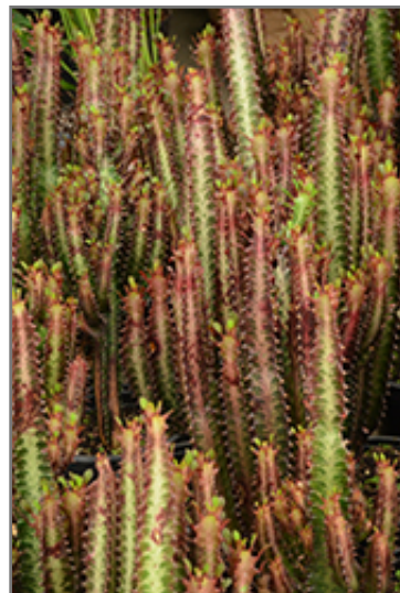
Rubra African Milk Tree stems

-- THIS IS A HOUSEPLANT AND IS NOT MEANT TO SURVIVE THE WINTER OUTDOORS IN OUR CLIMATE --