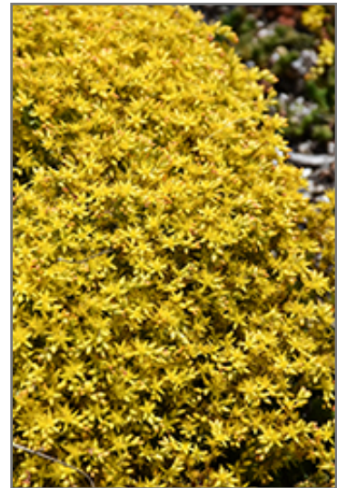
Aurora Pink Jelly Bean Plant flowers