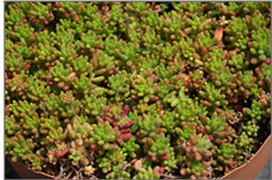
Aurora Pink Jelly Bean Plant

Aurora Pink Jelly Bean Plant is recommended for the following landscape applications;