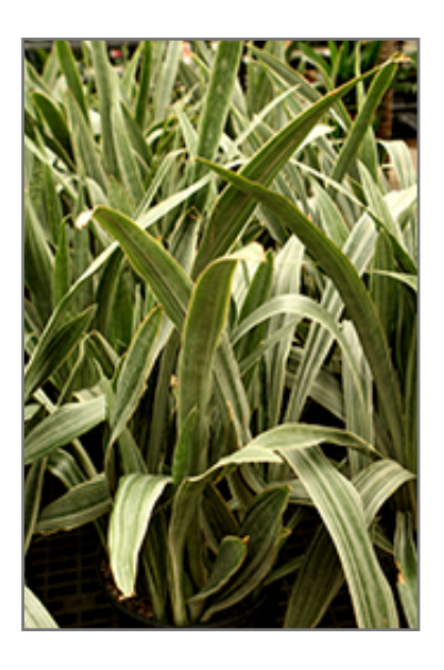
Sayuri Snake Plant foliage

When grown indoors, Sayuri Snake Plant can be expected to grow to be about 3 feet tall at maturity, with a spread of 18 inches. It grows at a slow rate, and under ideal conditions can be expected to live for approximately 10 years. This houseplant performs well in both bright or indirect sunlight and strong artificial light, and can therefore be situated in almost any well-lit room or location. It is very adaptable to both dry and moist soil, and should do just fine under average home conditions. The surface of the soil shouldn't be allowed to dry out completely, and so you should expect to water this plant once and possibly even twice each week. Be aware that your particular watering schedule may vary depending on its location in the room, the pot size, plant size and other conditions; if in doubt, ask one of our experts in the store for advice. It will benefit from a regular feeding with a general-purpose fertilizer with every second or third watering. It is not particular as to soil pH, but grows best in sandy soil. Contact the store for specific recommendations on pre-mixed potting soil for this plant.