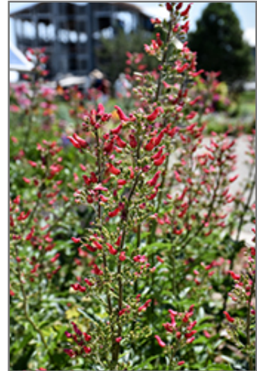
Red Birds In A Tree flowers

Red Birds In A Tree is a fine choice for the garden, but it is also a good selection for planting in outdoor pots and containers. With its upright habit of growth, it is best suited for use as a 'thriller' in the 'spiller-thriller-filler' container combination; plant it near the center of the pot, surrounded by smaller plants and those that spill over the edges. It is even sizeable enough that it can be grown alone in a suitable container. Note that when growing plants in outdoor containers and baskets, they may require more frequent waterings than they would in the yard or garden.