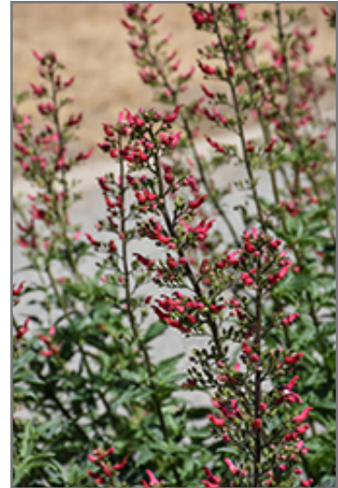
Red Birds In A Tree flowers