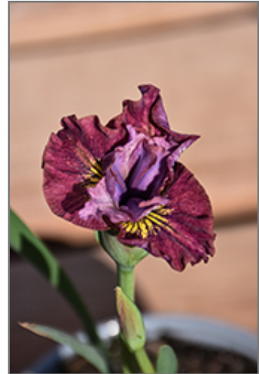
Miss Apple Siberian Iris flowers

Miss Apple Siberian Iris will grow to be about 24 inches tall at maturity, with a spread of 18 inches. When grown in masses or used as a bedding plant, individual plants should be spaced approximately 14 inches apart. It grows at a medium rate, and under ideal conditions can be expected to live for approximately 10 years. As an herbaceous perennial, this plant will usually die back to the crown each winter, and will regrow from the base each spring. Be careful not to disturb the crown in late winter when it may not be readily seen!