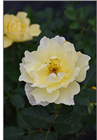
Yukon Sun Rose flowers