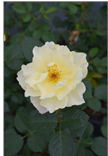
Yukon Sun Rose flowers