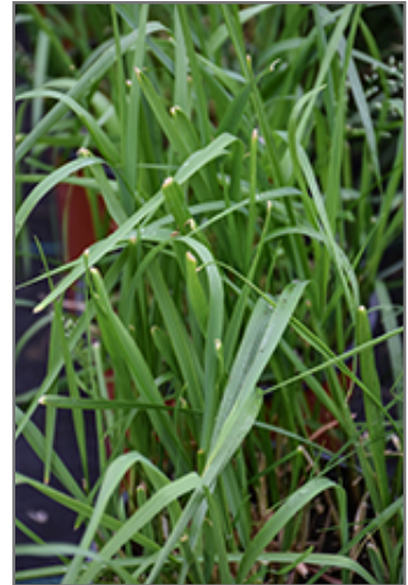
Sweet Grass foliage

An erect, slender, sweet smelling aromatic grass, producing small seed heads bearing broad, copper colored spikelets; it is considered a sacred herb by indigenous peoples in North America; extremely hardy, and will cover an area by spreading rhizomes