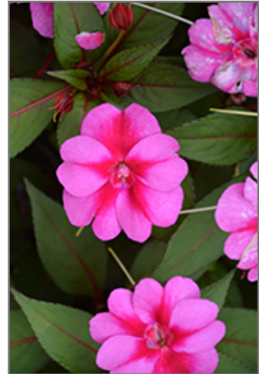
SunPatiens Compact Purple Candy Impatiens flowers

SunPatiens Compact Purple Candy Impatiens is recommended for the following landscape applications;