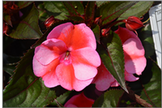
SunPatiens Compact Red Candy Impatiens flowers

SunPatiens Compact Red Candy Impatiens is recommended for the following landscape applications;