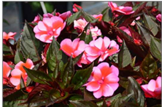
SunPatiens Compact Red Candy Impatiens flowers