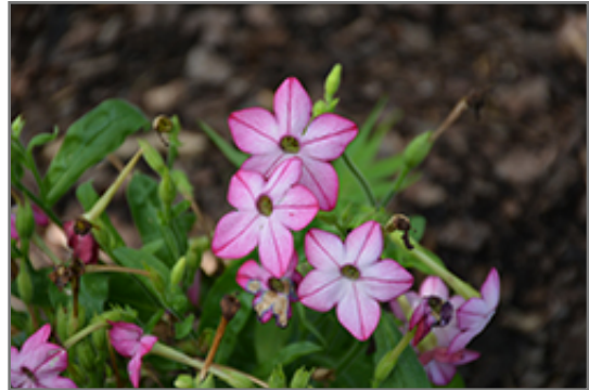
Saratoga Purple Bicolor Flowering Tobacco flowers