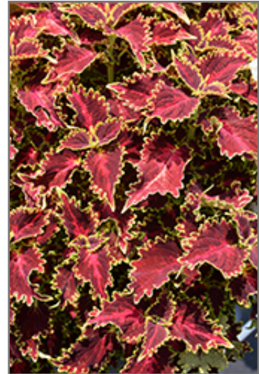
Volcanica Solar Flare Coleus foliage

Volcanica Solar Flare Coleus is a fine choice for the garden, but it is also a good selection for planting in outdoor containers and hanging baskets. It can be used either as 'filler' or as a 'thriller' in the 'spiller-thriller-filler' container combination, depending on the height and form of the other plants used in the container planting. It is even sizeable enough that it can be grown alone in a suitable container. Note that when growing plants in outdoor containers and baskets, they may require more frequent waterings than they would in the yard or garden.