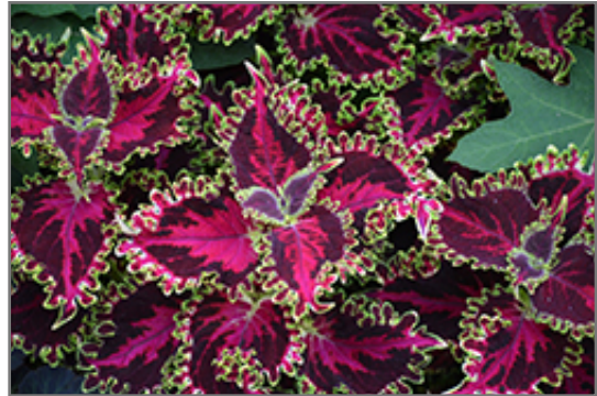
Volcanica Solar Flare Coleus foliage

Volcanica Solar Flare Coleus is recommended for the following landscape applications;