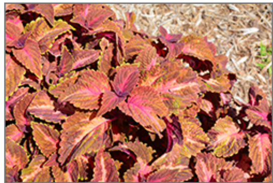
Main Street Sunset Boulevard Coleus foliage