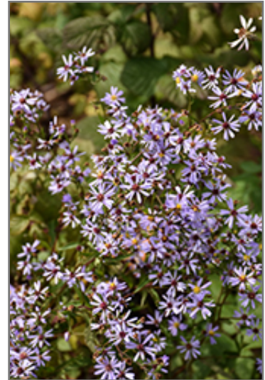
Blue Wood Aster flowers