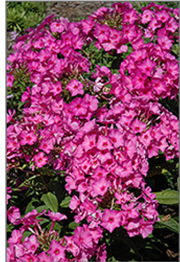
Flame Pink Garden Phlox flowers