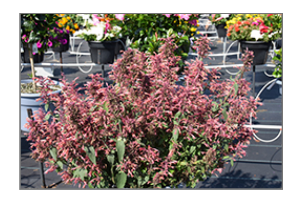
Guava Lava Anise Hyssop in bloom