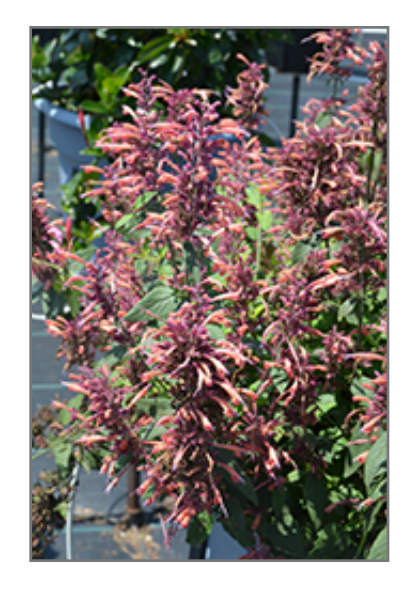
Guava Lava Anise Hyssop flowers