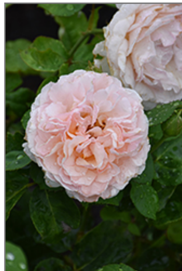
Emily Brontë Rose flowers

An outstanding shrub rose presenting fully double, soft pink and apricot blooms bearing a strong tea fragrance with hints of lemon and grapefruit; one of the few shade tolerant roses; good disease resistance; hardy with some protection