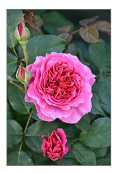
Gabriel Oak Rose flowers