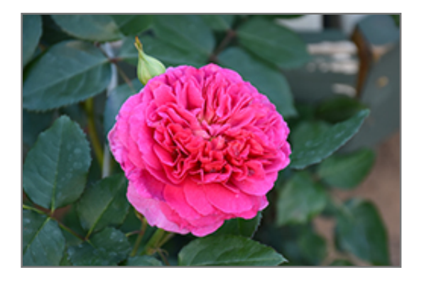
Gabriel Oak Rose flowers