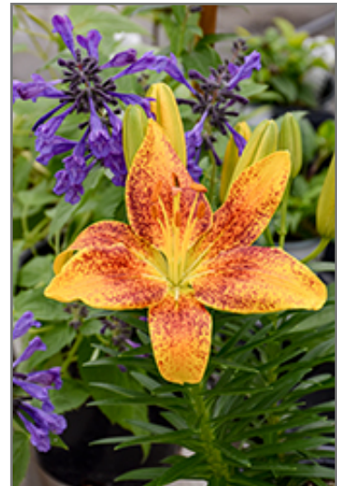
Lily Looks Tiny Parrot Lily flowers