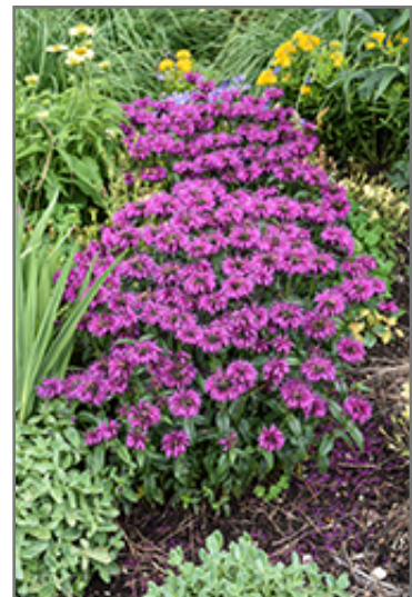
Electric Neon Purple Beebalm in bloom