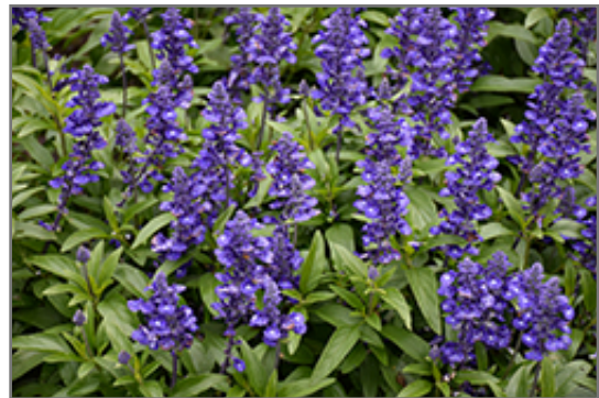
Sallyfun Blue Lagoon Salvia flowers