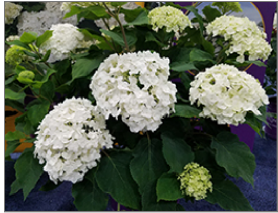
FlowerFull Smooth Hydrangea flowers

FlowerFull Smooth Hydrangea will grow to be about 3 feet tall at maturity extending to 4 feet tall with the flowers, with a spread of 5 feet. It tends to be a little leggy, with a typical clearance of 1 foot from the ground. It grows at a fast rate, and under ideal conditions can be expected to live for approximately 20 years.