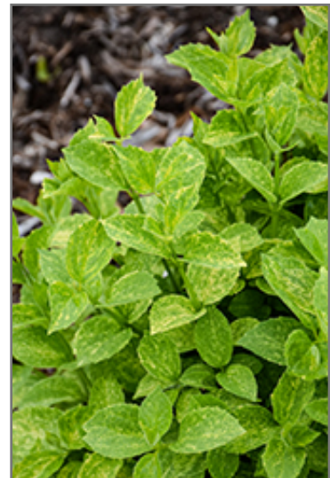
Illuminati Sparks Mockorange foliage