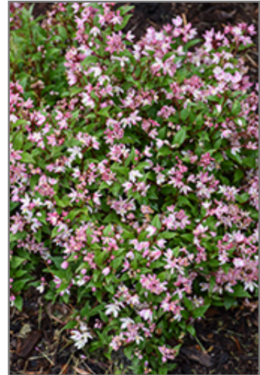
Yuki Kabuki Deutzia flowers