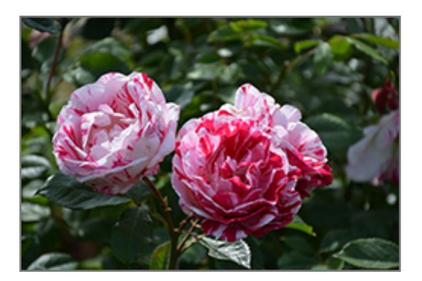
Scentimental Rose flowers

This shrub will require occasional maintenance and upkeep, and is best pruned in late winter once the threat of extreme cold has passed. Gardeners should be aware of the following characteristic(s) that may warrant special consideration;