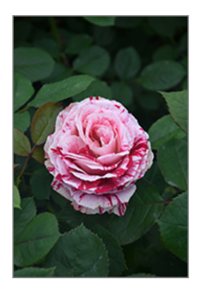
Scentimental Rose flowers