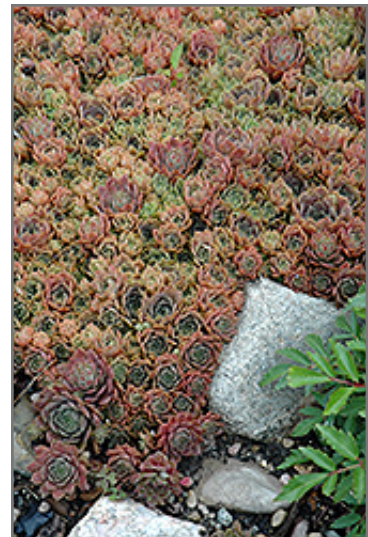
Silverine Hens And Chicks