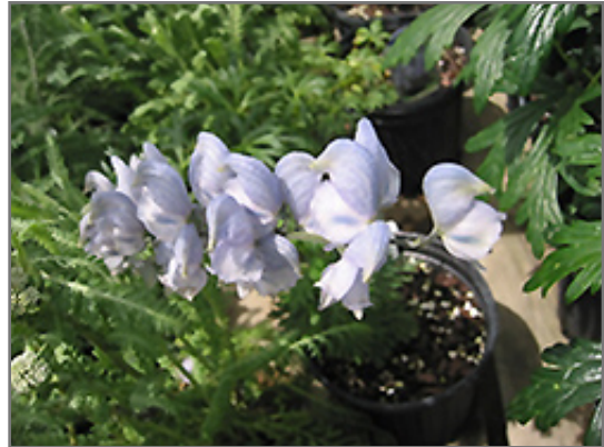
Stainless Steel Monkshood flowers