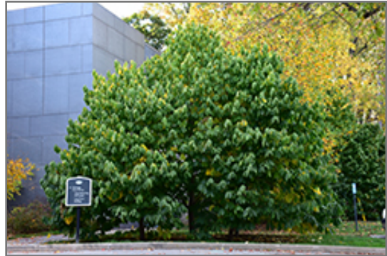
Common Paw Paw

Common Paw Paw features unusual lightly-scented nodding purple flowers from mid to late spring. It has dark green deciduous foliage. The large oval leaves turn an outstanding lemon yellow in the fall. It features an abundance of magnificent green berries from mid to late summer. The fruit can be messy if allowed to drop on the lawn or walkways, and may require occasional clean-up.