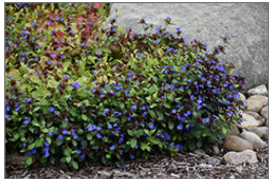
Plumbago in bloom