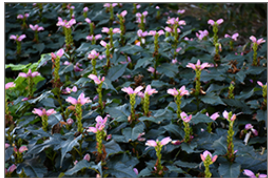
Hot Lips Turtlehead in bloom