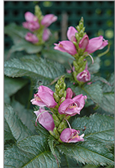
Hot Lips Turtlehead flowers

Hot Lips Turtlehead is recommended for the following landscape applications;