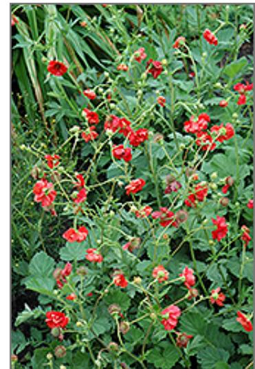
Blazing Sunset Avens in bloom