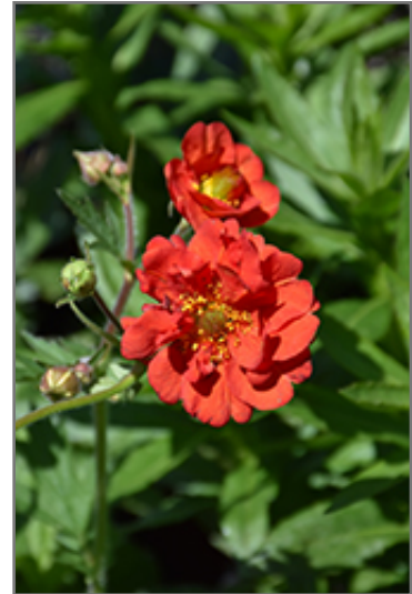
Blazing Sunset Avens flowers

Blazing Sunset Avens is recommended for the following landscape applications;