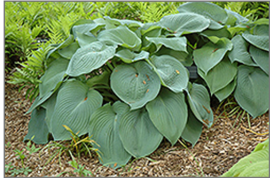
Big Daddy Hosta

Big Daddy Hosta is recommended for the following landscape applications;