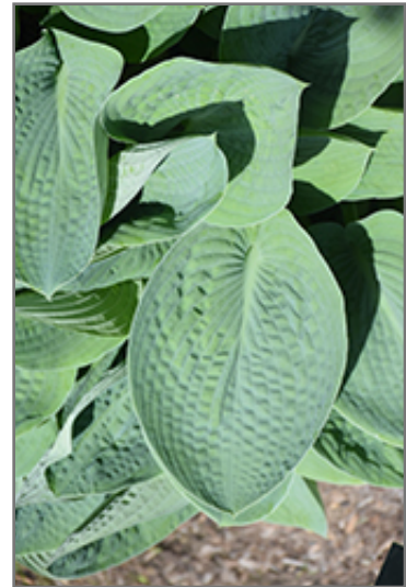
Big Daddy Hosta foliage