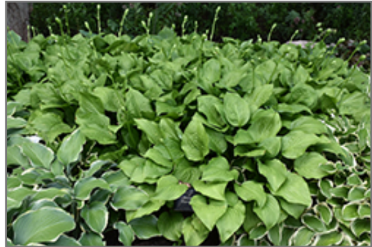
Royal Standard Hosta

Royal Standard Hosta is recommended for the following landscape applications;