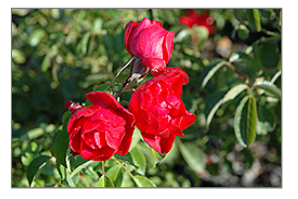
Flower Carpet Scarlet Rose flowers

Flower Carpet Scarlet Rose is blanketed in stunning lightly-scented double scarlet flowers at the ends of the branches from late spring to early fall. The flowers are excellent for cutting. It has dark green deciduous foliage. The glossy oval compound leaves do not develop any appreciable fall colour. The fruits are showy red hips displayed in late fall.