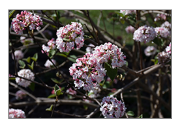
Koreanspice Viburnum flowers