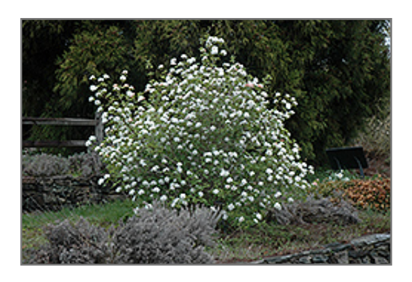
Koreanspice Viburnum in bloom

This is a relatively low maintenance shrub, and should only be pruned after flowering to avoid removing any of the current season's flowers. It is a good choice for attracting birds to your yard, but is not particularly attractive to deer who tend to leave it alone in favor of tastier treats. It has no significant negative characteristics.