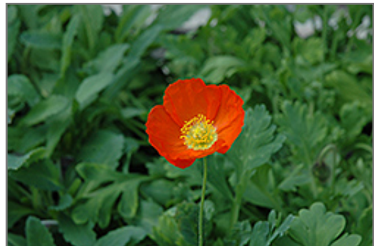
Champagne Bubbles Poppy flowers