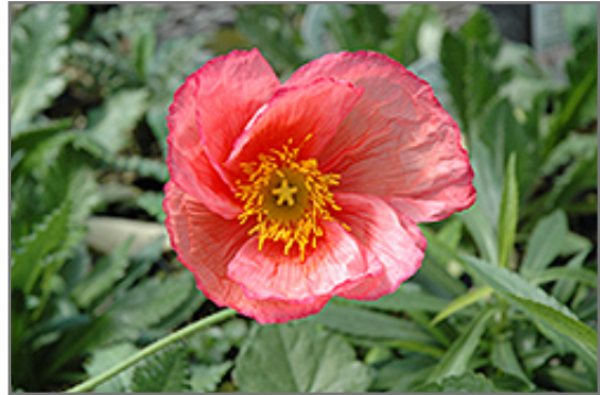
Champagne Bubbles Poppy flowers

This plant does best in full sun to partial shade. It prefers dry to average moisture levels with very well-drained soil, and will often die in standing water. It is not particular as to soil type or pH. It is somewhat tolerant of urban pollution, and will benefit from being planted in a relatively sheltered location. Consider covering it with a thick layer of mulch in winter to protect it in exposed locations or colder microclimates. This is a selection of a native North American species.