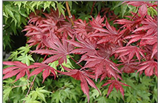
Trompenburg Japanese Maple foliage

Trompenburg Japanese Maple is recommended for the following landscape applications;