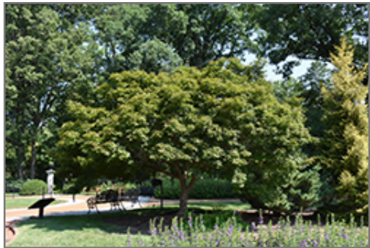
Trompenburg Japanese Maple

This tree does best in full sun to partial shade. You may want to keep it away from hot, dry locations that receive direct afternoon sun or which get reflected sunlight, such as against the south side of a white wall. It prefers to grow in average to moist conditions, and shouldn't be allowed to dry out. It is not particular as to soil pH, but grows best in rich soils. It is somewhat tolerant of urban pollution, and will benefit from being planted in a relatively sheltered location. Consider applying a thick mulch around the root zone in winter to protect it in exposed locations or colder microclimates. This is a selected variety of a species not originally from North America.