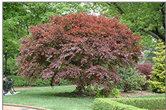
Trompenburg Japanese Maple