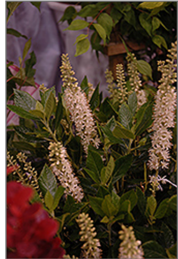
Sixteen Candles Summersweet flowers