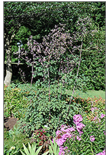
Rochebrun Meadow Rue in bloom