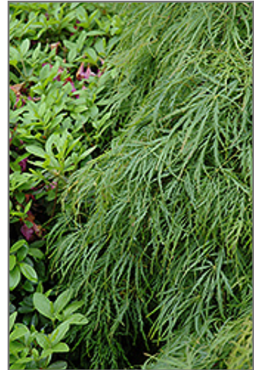
Cutleaf Japanese Maple foliage

Cutleaf Japanese Maple is recommended for the following landscape applications;