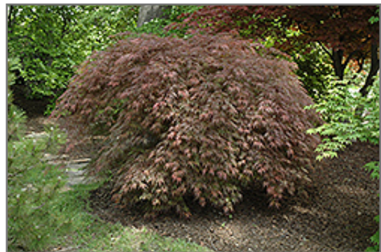
Inaba Shidare Cutleaf Japanese Maple