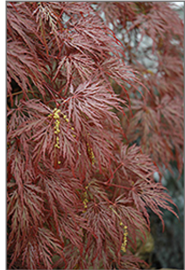
Inaba Shidare Cutleaf Japanese Maple foliage

Inaba Shidare Cutleaf Japanese Maple is ideal for use as a garden accent or patio feature, and is recommended for the following landscape applications;