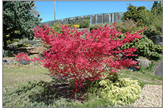
Shindeshojo Japanese Maple in spring

This dwarf tree does best in full sun to partial shade. You may want to keep it away from hot, dry locations that receive direct afternoon sun or which get reflected sunlight, such as against the south side of a white wall. It prefers to grow in average to moist conditions, and shouldn't be allowed to dry out. It is not particular as to soil pH, but grows best in rich soils. It is somewhat tolerant of urban pollution, and will benefit from being planted in a relatively sheltered location. Consider applying a thick mulch around the root zone in winter to protect it in exposed locations or colder microclimates. This is a selected variety of a species not originally from North America.