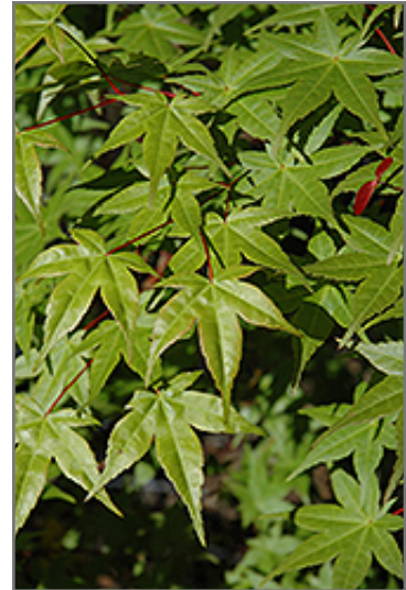
Shindeshojo Japanese Maple foliage

Shindeshojo Japanese Maple is ideal for use as a garden accent or patio feature, and is recommended for the following landscape applications;