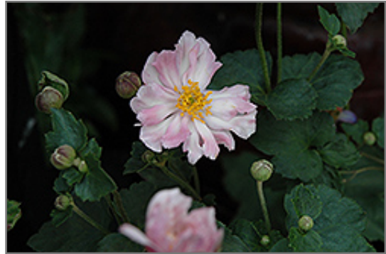
Queen Charlotte Anemone flowers

Queen Charlotte Anemone will grow to be about 24 inches tall at maturity extending to 3 feet tall with the flowers, with a spread of 30 inches. Its foliage tends to remain dense right to the ground, not requiring facer plants in front. It grows at a medium rate, and under ideal conditions can be expected to live for approximately 10 years. As an herbaceous perennial, this plant will usually die back to the crown each winter, and will regrow from the base each spring. Be careful not to disturb the crown in late winter when it may not be readily seen!