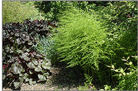
Mary Washington Asparagus

This plant is typically grown in a designated vegetable garden. It does best in full sun to partial shade. It does best in average to evenly moist conditions, but will not tolerate standing water. It is not particular as to soil pH, but grows best in rich soils. It is somewhat tolerant of urban pollution. This particular variety is an interspecific hybrid, and it is considered by many to be an heirloom variety.