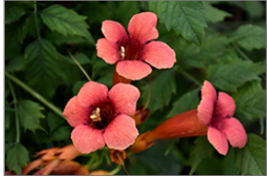
Flamenco Trumpetvine flowers