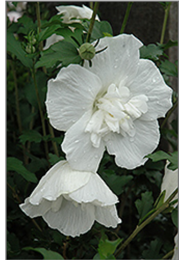
White Chiffon Rose of Sharon flowers

White Chiffon Rose of Sharon is recommended for the following landscape applications;