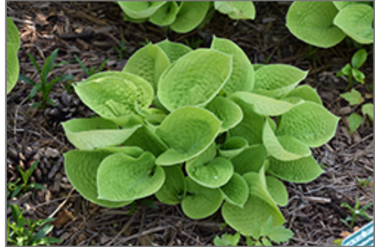
Maui Buttercups Hosta

Maui Buttercups Hosta is recommended for the following landscape applications;