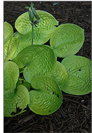
Maui Buttercups Hosta foliage