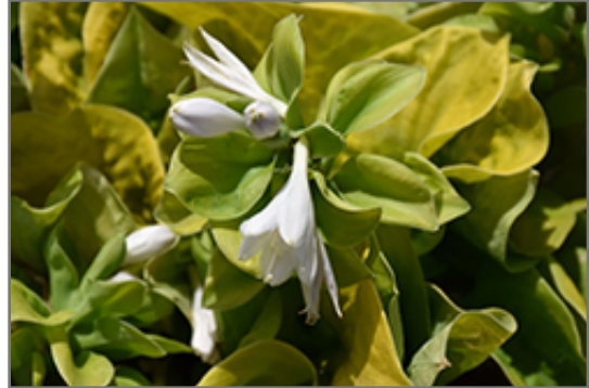
Maui Buttercups Hosta flowers

Maui Buttercups Hosta will grow to be only 6 inches tall at maturity extending to 10 inches tall with the flowers, with a spread of 12 inches. When grown in masses or used as a bedding plant, individual plants should be spaced approximately 10 inches apart. Its foliage tends to remain low and dense right to the ground. It grows at a slow rate, and under ideal conditions can be expected to live for approximately 10 years. As an herbaceous perennial, this plant will usually die back to the crown each winter, and will regrow from the base each spring. Be careful not to disturb the crown in late winter when it may not be readily seen!