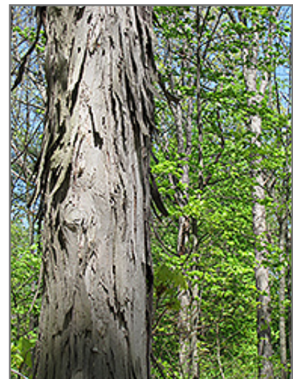
Shagbark Hickory bark