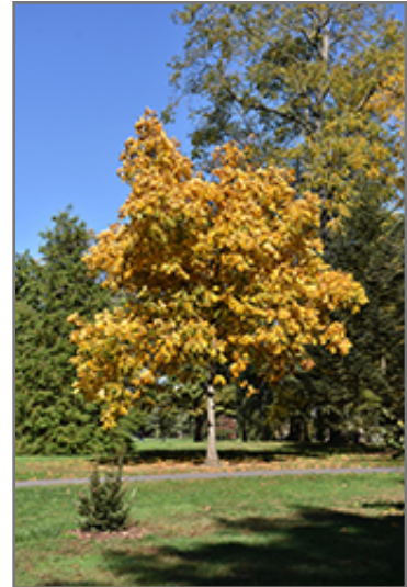
Shagbark Hickory in fall

This tree does best in full sun to partial shade. It is very adaptable to both dry and moist locations, and should do just fine under average home landscape conditions. It is not particular as to soil pH, but grows best in rich soils. It is somewhat tolerant of urban pollution. This species is native to parts of North America.