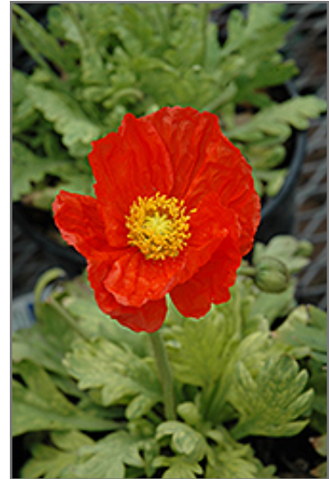
Garden Gnome Poppy flowers