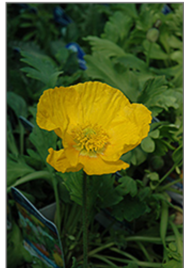
Garden Gnome Poppy flowers