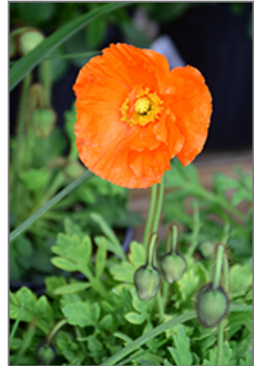
Garden Gnome Poppy flowers

This plant does best in full sun to partial shade. It prefers dry to average moisture levels with very well-drained soil, and will often die in standing water. It is not particular as to soil type or pH. It is somewhat tolerant of urban pollution, and will benefit from being planted in a relatively sheltered location. Consider covering it with a thick layer of mulch in winter to protect it in exposed locations or colder microclimates. This is a selection of a native North American species.